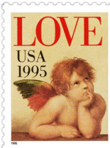
1995 The first 'non-denominated' love stamp set. Design by Terry McCaffrey.