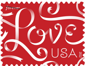
2012 Connecting ribbon pattern. Design by Louise Fili.