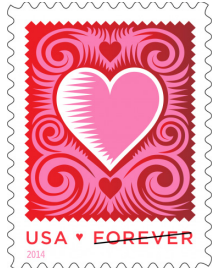
2014 Cut paper design by Antonio Alcalá.