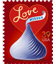
2007 Chocolate kiss centennial. Design by Derry Noyes.