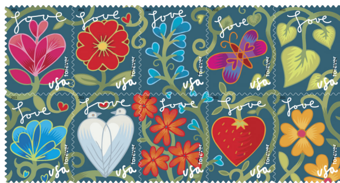
2011 The first forever and first set of ten love stamps. Design by Derry Noyes.