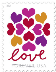
2019 Hearts blossom, design by Antonio Alcalá.