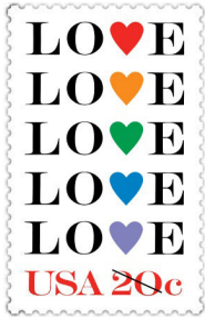
1984 Hearts replace the letter V, design by Bradbury Thompson.