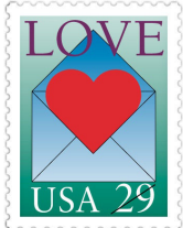
1992 Mail more love! Design by Uldis Purins.