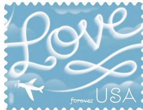
2017 Skywriting design by Louise Fili.