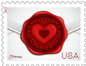
2013 Envelope with wax seal. Design by Louise Fili.