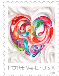
2016 Quilled paper art. Design by Antonio Alcalá.