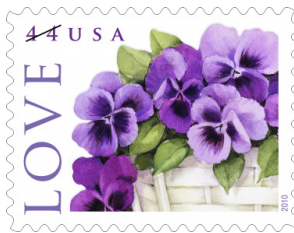
2010 Design by Derry Noyes.