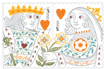
2009 The first se-tenant love stamp issue. Design by Jeanne Greco.