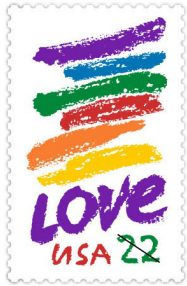
1985 Artwork by Sister Corita Kent.