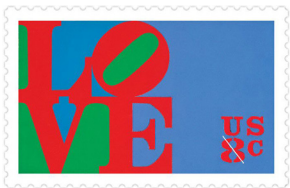
1973 The first USPS love stamp, designed by artist Robert Indiana.