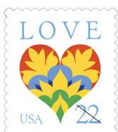
1987 Design by John Alcorn.