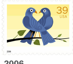
2006 Bluebirds form a heart. Design by Craig Frazier.