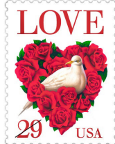
1994 Victorian-inspired doves and roses set, design by Lon Busch.