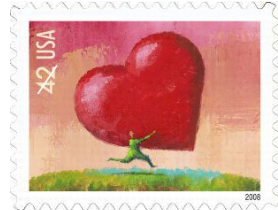
2008 Design by Ethel Kessler.