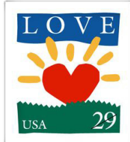
1994 The first love self-adhesive, design by Peter Good.